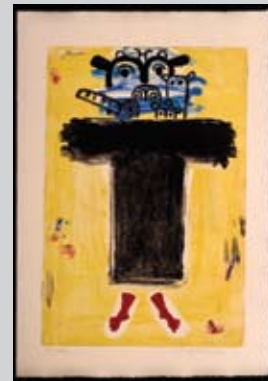
Jaune Quick-to-See Smith Tribe no date, monoprint YAM Permanent Collection