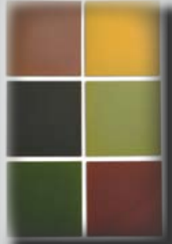
Anne Appleby River Birch 1998, oil & wax on panel YAM Permanent Collection