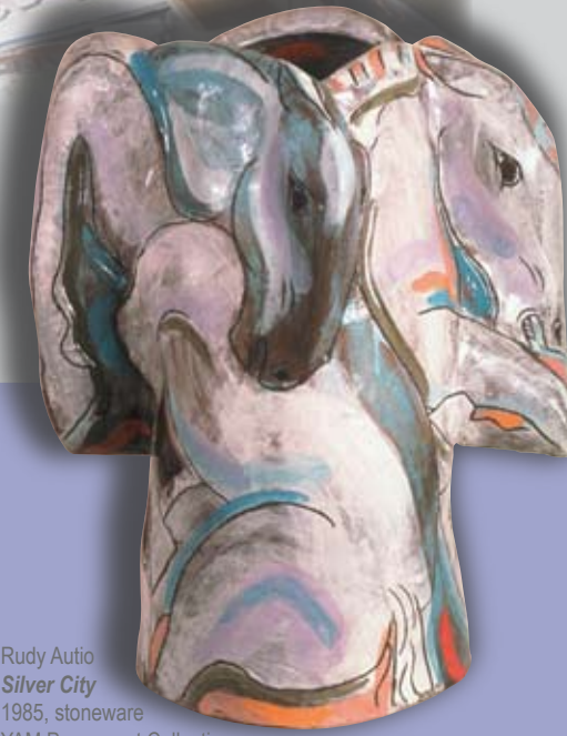
Rudy Autio Silver City 1985, stoneware YAM Permanent Collection