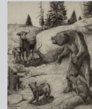
Will James Mothers 1919, pencil drawing YAM Permanent Collection